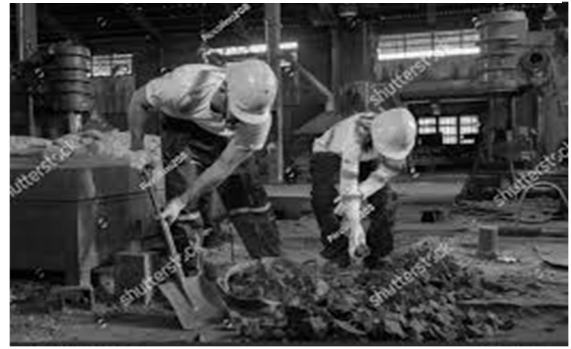
Shoveling and cleaning up of various materials including oil and grease