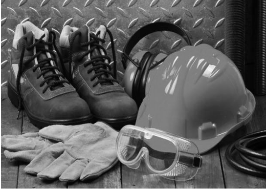
Wear required PPE