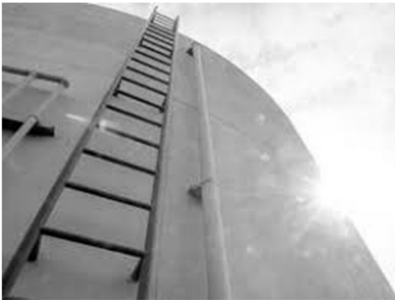
Vertical stairs (lanyard must be worn)